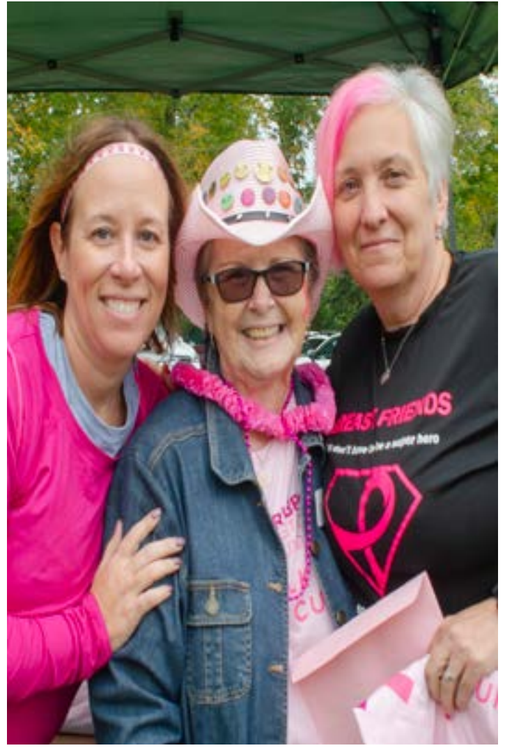
Three ladies supporting the cause at the TBBCF walk.

to scientists and institutions dedicated towards discovering effective treatments. They play an essential role in informing us and bettering our understanding of breast cancer while improving the lives impacted by it.