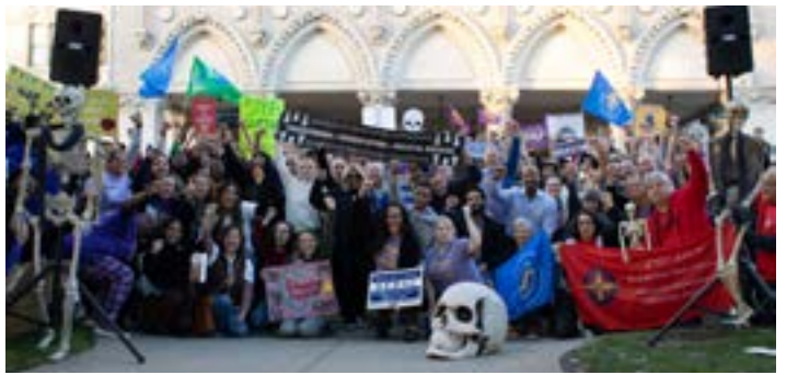
in front of the legislator's office in Hartford

changing demands and update their programs accordingly. This could give rise to skill shortages leading towards diminished competitiveness on a global scale while having long-term negative impacts