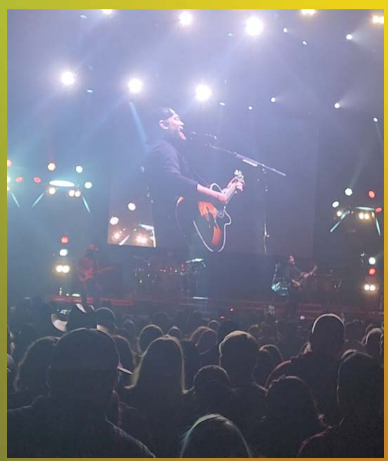
Lee Brice having a moment of unity with the crowd.