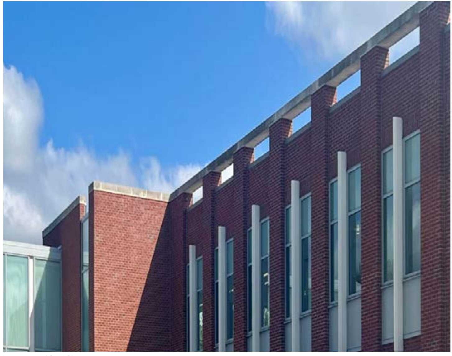
Exterior view of the TRCC campus.

You're not alone. It's ok to fall short. It's not the end of the world. If you feel like you're struggling this late into the semester, approach your professors and academic advisors on any solutions to help put you back on track. Assess if withdrawing from a class is the best option for you without it affecting your GPA. The final day to withdraw from classes for the 2023 Fall semester is <u>November 17</u>.