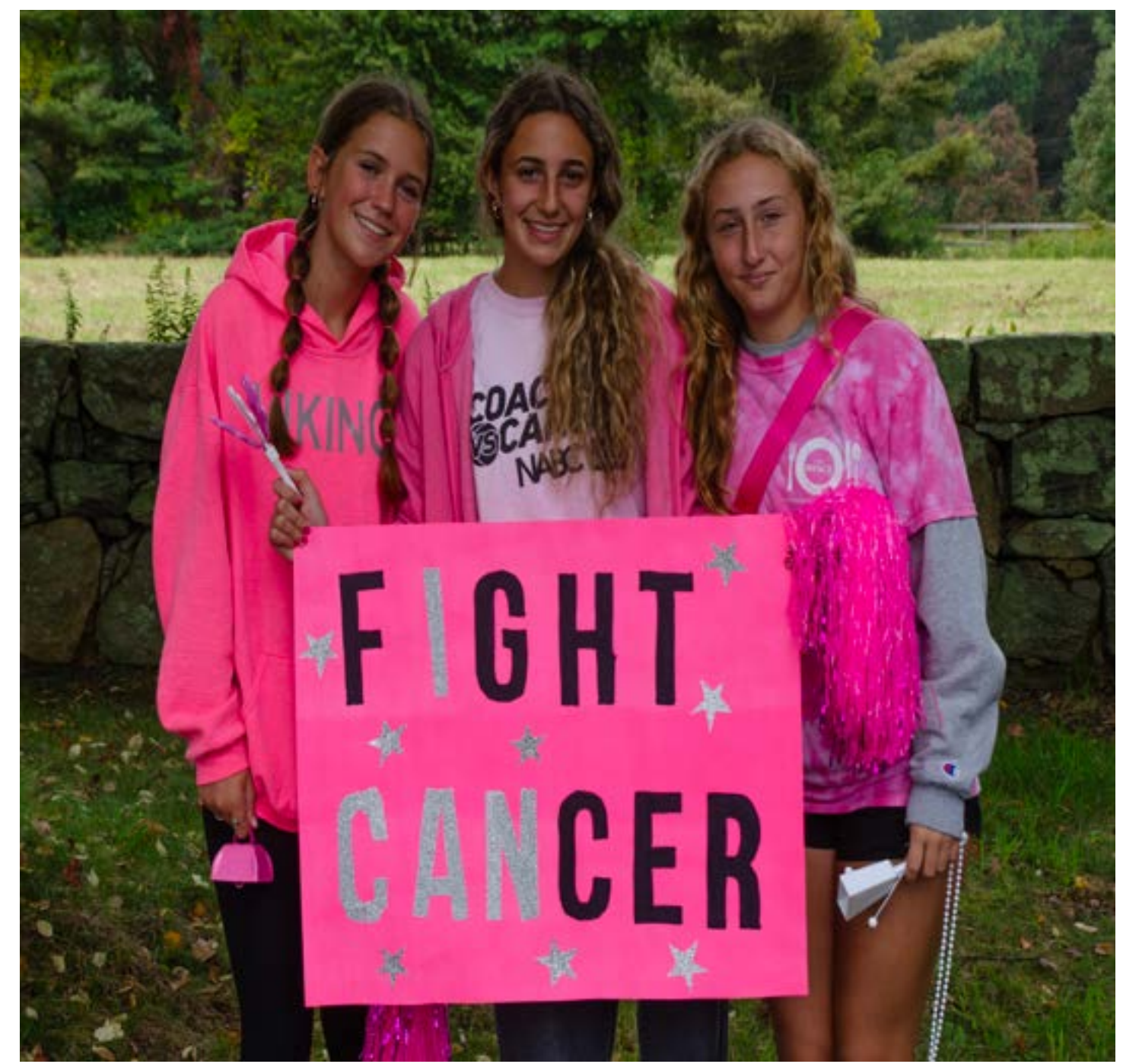
Three participants at the TBBCF walk, holding up a "Fight Cancer" sign to support the cause.