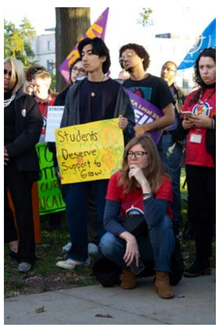
Student and Teacher listening to speeches at CT State Rally in Hartford.

Vulnerable and undervalued communities may suffer disproportionately due to budget cuts. Community college attendees often come from low-income families or are first-generation students seeking higher education. These institutions serve as a pathway for social and economic advancement in their lives. However, when budgets are reduced, these individuals encounter greater obstacles on the path towards obtaining a degree while also worsening inequality by creating an opportunity gap between them and others who receive sufficient support.