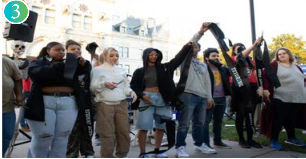
Students from various community colleges partake in the sash-cutting ceremony