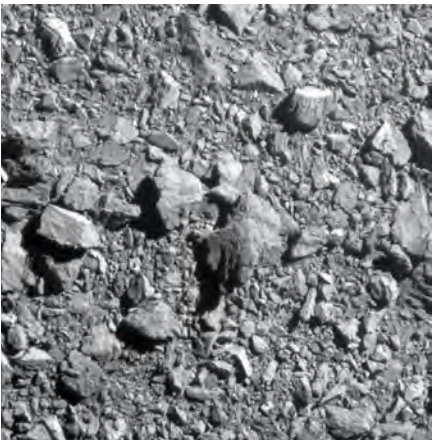
One of the last images taken by the DART spacecraft, just two seconds before collision.

NASA's Double Asteroid Redirection Test, also known as DART, hit a targeted asteroid after 10 months in space on September 26.