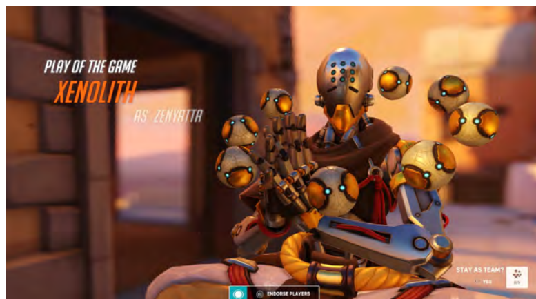
"Play of the Game" screen in Overwatch 2, showing the playable character Zenyatta.