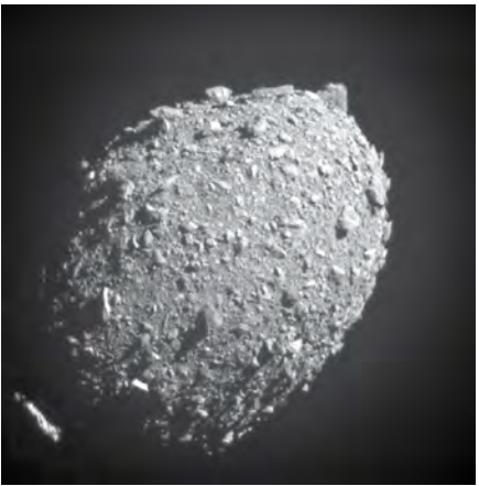
An image taken by the DART spacecraft 11 seconds before it collided with the asteroid.