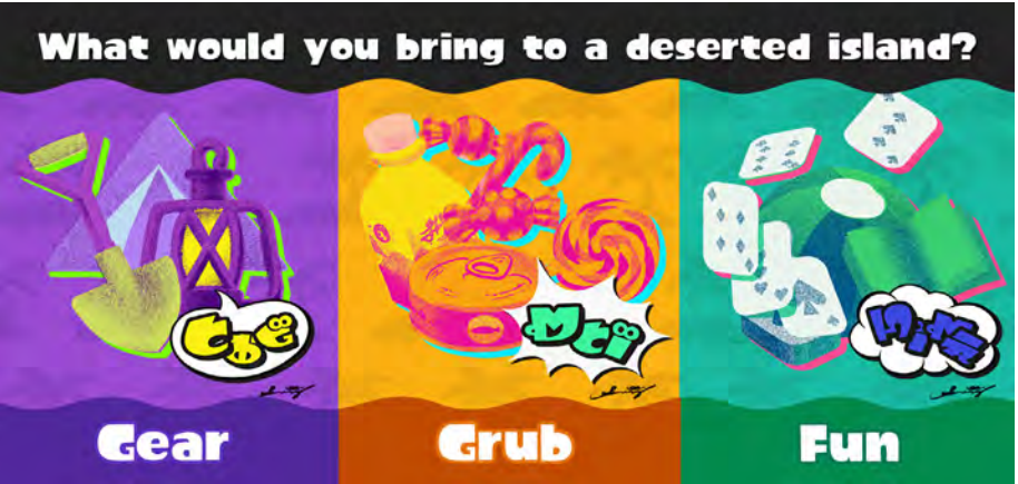
The three Splatfest teams: Gear, Grub, and Fun.

What would you bring to a deserted island? This question was explored in a Splatoon 3 event. Splatoon 3 is a third-person shooter game by Nintendo where humanoid squids and octopi (called Inklings and Octolings) participate in ink-based battles. The Splatfest is a live, in-game event that occurs every few weeks or months.