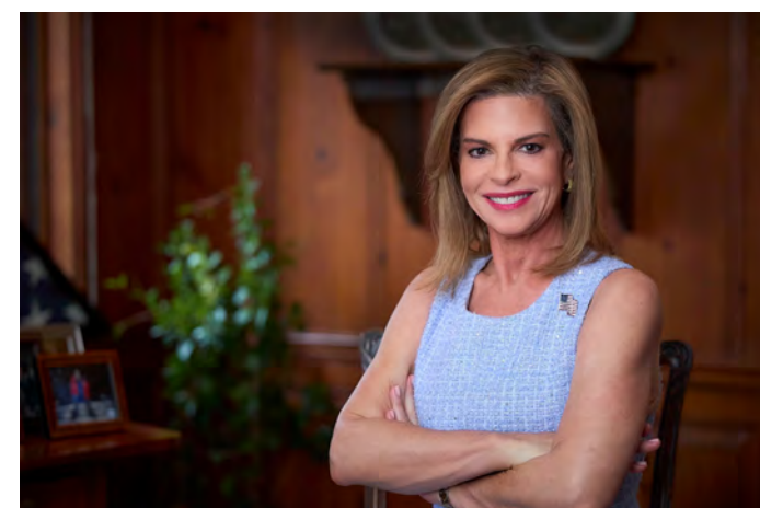
Leora Levy is the Republican candidate for Senate this year.