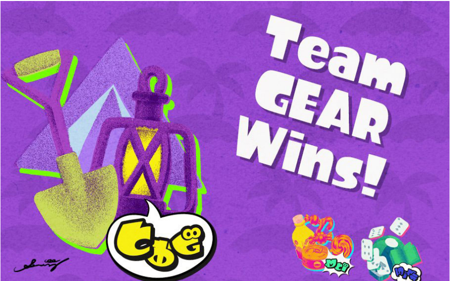
Team Gear is announced as the winner.

The “Gear, Grub, Fun” Splatfest was announced during the Nintendo Direct, a live presentation, on September 13th. Three options were presented by the game’s band known as Deep Cut: Gear (represented by Shiver, an Octoling), Grub (represented by Frye, an Inkling) and Fun (represented by Big Man, a manta ray). Players could pick their favorite option, wear a themed t-shirt and battle each other in Turf Wars.