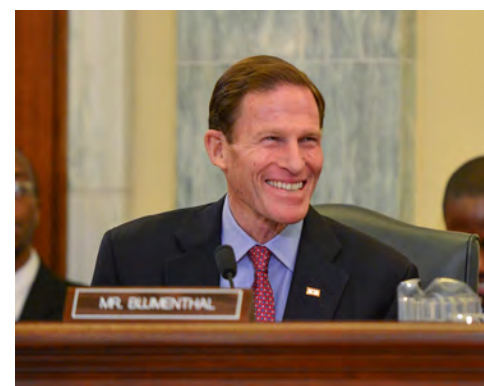
Richard Blumenthal is the Democrat candidate for Senate this year.

Senate: The Senate is responsible for voting on bills, resolutions, amendments, motions, nominations and treaties, according to the "Powers and Procedures" page on the Senate's official website (Senate.gov).