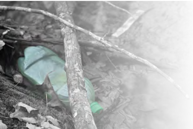
Plastic is one of the many things that cause harm to the environment when not disposed of.

on it, it should not be recycled. Only parts that are clean should be thrown into the recycling bin while the rest should just be tossed into the garbage. Do not forget to also clean products as much as possible when planning to recycle them.