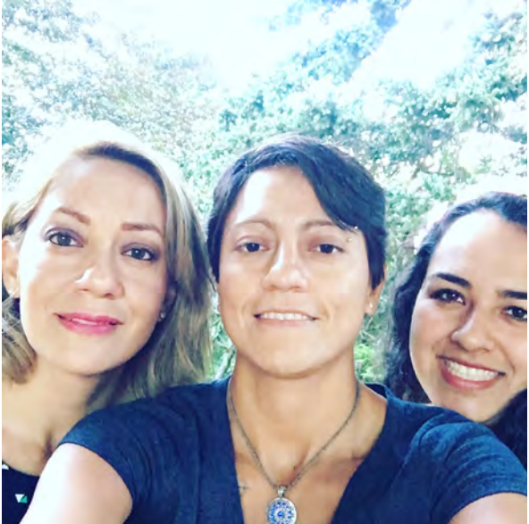
Always be open to talk to people. Keep an open mind and you just might find a new best friend.

While the thought of having so much freedom in college can sound exciting, the idea of being surrounded by hundreds of complete strangers can be scary for some. Meeting new people and making new friends requires some effort (especially in college) but it is doable. Showing up to class is the first step. Take a deep breath and get out of your comfort zone. Remember that you are not the only one starting a new chapter in your life. Here are some tips to help you connect with your college classmates, keep an open mind and stay true to yourself.