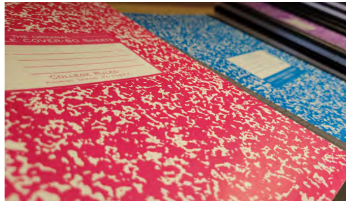
Traditional notebooks face competition with digital devices.

Technology has revolutionized how people live and learn. It has changed the way that they interact with the world to the smallest detail. The days of waiting for the mailman to deliver an important letter have been nearly replaced by e-mails.