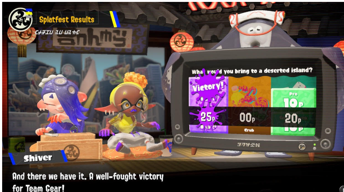
Team Gear won the Splatfest with 25 points, compared to Fun's 20 and Grub's 0 (Photo by: Nintendo of America on Twitter).

The event lasted from September 23 to 25 (8-8pm EST). The main objective for each team was to cover the most ground with ink, which was purple, orange or green depending on the player's choice! During the second half of the Splatfest, all three teams were able to participate in Tricolor Turf Wars, a new addition to the Splatoon series. The team in the lead (Fun) had four players to defend the Ultra Signal, a signal that calls one of the members of Deep Cut to help ink the battlefield and give the team an advantage. The other two teams (which had two players each) were responsible for capturing the Ultra Signal and inking the most ground.