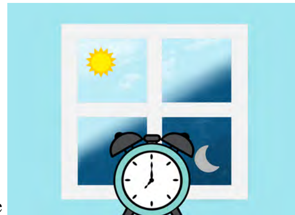
A graphic representing daylight saving time.

However, early risers including school bus drivers object to this change since it sometimes means having to pick up school children in the dark and this is considered to be an issue of safety.