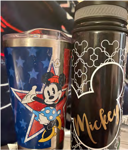
Different kinds of water bottles.

Being a college student means a lot of new responsibilities. Hard work, patience, persistence, and dedication are some of the few skills every college student needs to succeed. It may be difficult to determine what college students need or want, but there are plenty of gift ideas for them that can be useful during the semester. Small gestures can go a long way.