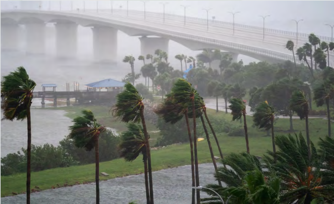
Winds gusting across the John Ringling Causeway. Hurricane Ian made US landfall at Cayo Costa in Florida as a category 4 hurricane, with windspeeds over 140mph (225km/h) in some areas.

Hurricane Ian was a Category 4 hurricane, which makes it one of the strongest hurricanes possible. It managed to flood and float away the bridges, cars, roads, homes, and boats. It is said that there has been an estimate of $67 billion dollars lost in damages. It has also been reported that at least 119 people have passed away during the hurricane due to drowning.