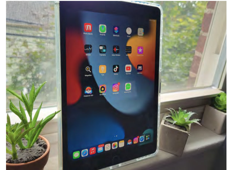
Digital devices like iPads can be used to take notes and read e-books.

Buying an e-book can have environmental benefits due to the large number of trees that have to be cut down to produce paper, but some argue that the toll on the environment has changed since it requires other things to create technology, not to mention factories that produce pollution.