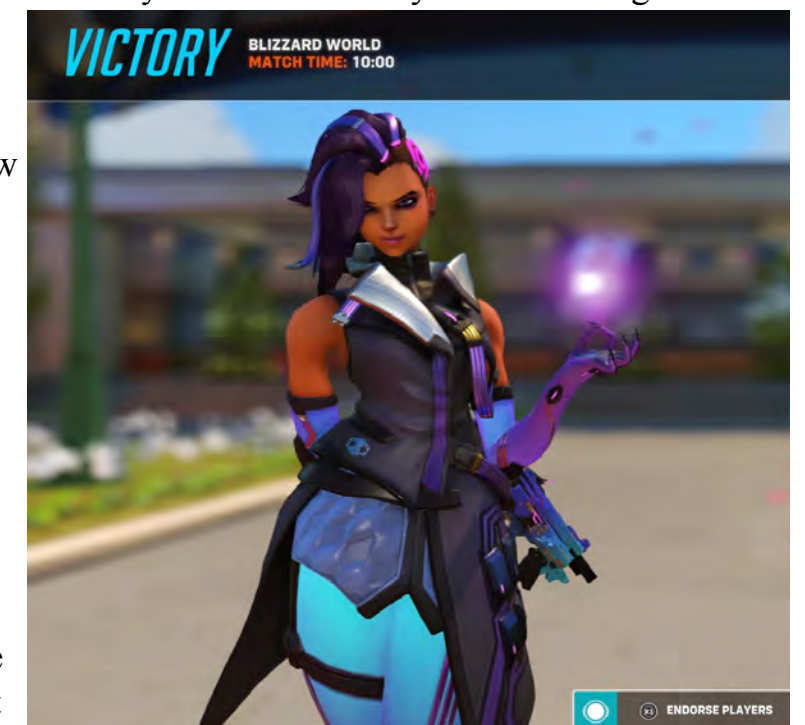
"Victory" screen in Overwatch 2, showing the playable character Sombra.

Only time will tell if this game will become something better or just a failed experiment by Blizzard Entertainment.