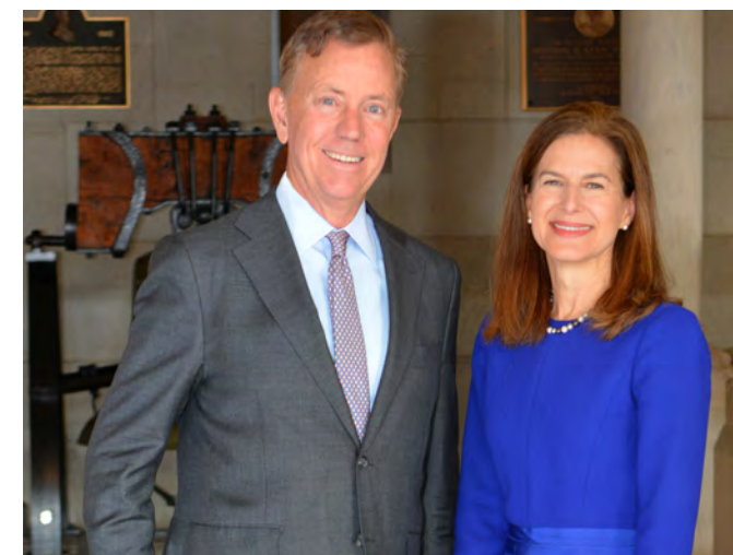
A portrait of Ned Lamont and Susan Bysiewicz, Democrat candidates for governor and Lieutenant Governor (respectively) this year.

Bysiewicz is the 109th Lieutenant Governor of CT and is Lamont’s running mate.