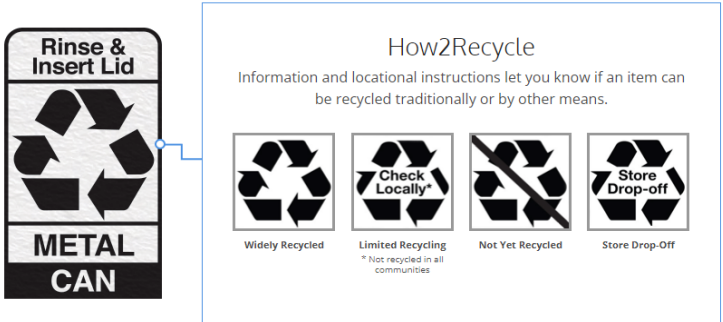
Guide on what the recycle logo means on a variety of labels.

Just because it qualifies as a recyclable object does not mean that it is fit to be recycled. The condition of the object is an important factor. If cardboard or plastic has remains of food or stains