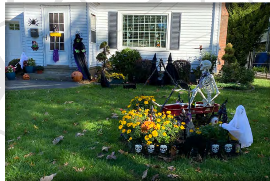
Decorated House