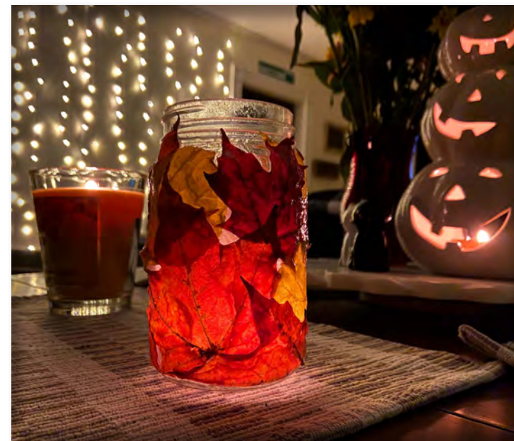
Final Tealight Holder