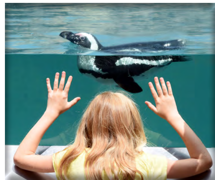
Mystic Aquarium Penguin

is forty and female who has been with us almost her whole life since the 80's, and Natasha who is also forty and female who has been here a couple times before but officially moved in from SeaWorld San Antonio in 2019. There are also four more from Canada that we recently received who currently have no name, all females around six to seven years old."