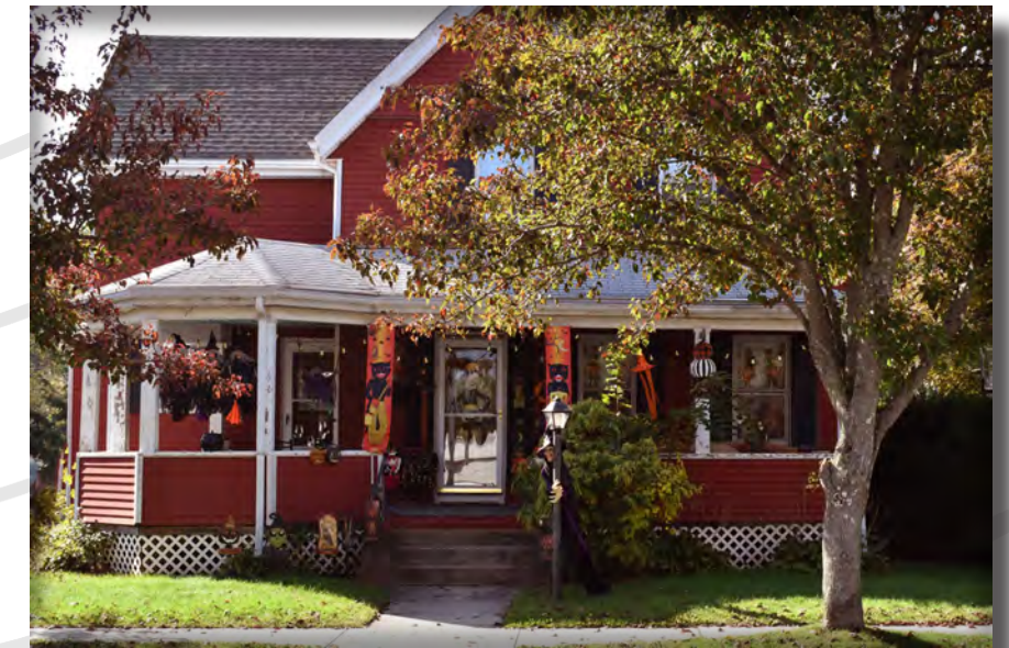
Decorated House

Each house has its own personality and here are some ideas your neighbors have created.