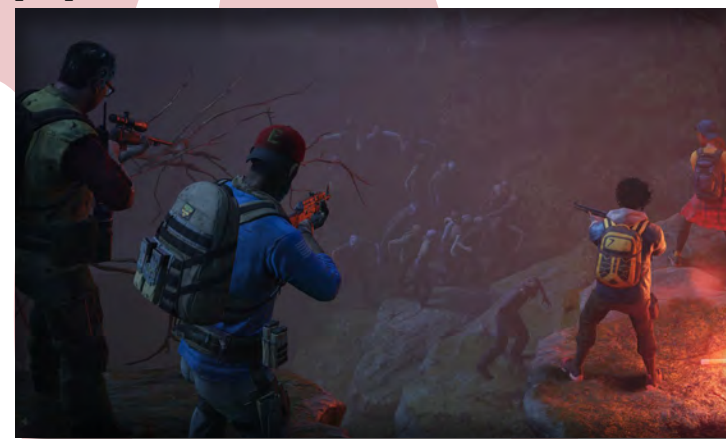
Back 4 Blood Promotional

The more difficult it is to enter a room, the more likely it is to contain valuable prizes. Normally, you're looking for different attachments for your weapons that can affect how they play, especially if they're higher up on the rarity ladder. Ammunition, grenades, and one-time-use things such as propane tanks and other items are also available.