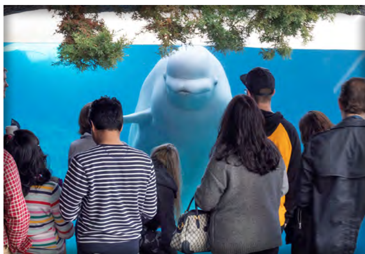
Mystic Aquarium Beluga

Rabeneck also shared that "we actually just wrapped up first responders training which included people from Rhode Island, Connecticut and Fisher's Island. When they get a hotline call, they go to the area to watch the animal from a distance and keep the aquarium updated on what's happening."