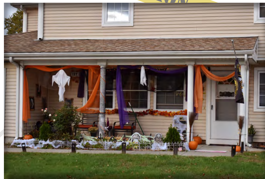
Decorated House