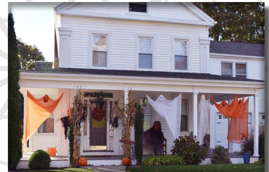
Decorated House