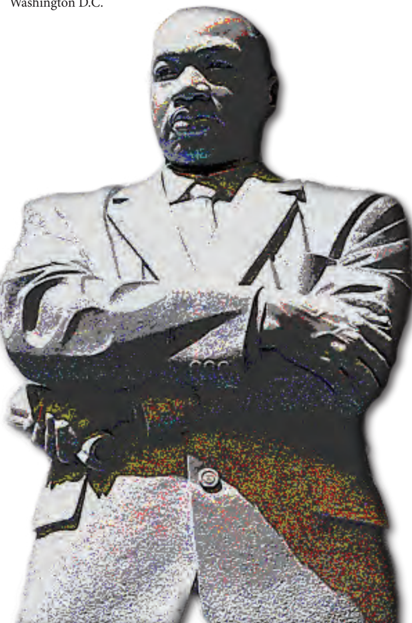
Martin Luther King Jr Monument in Washington D.C.

There's a lot of stories from history that were misplaced in those days. For the sake of the color lines that were being portrayed to stay protected. We can break those lines and become equally interested in our history. This way when we get to the future, we can be proud of where we came from.