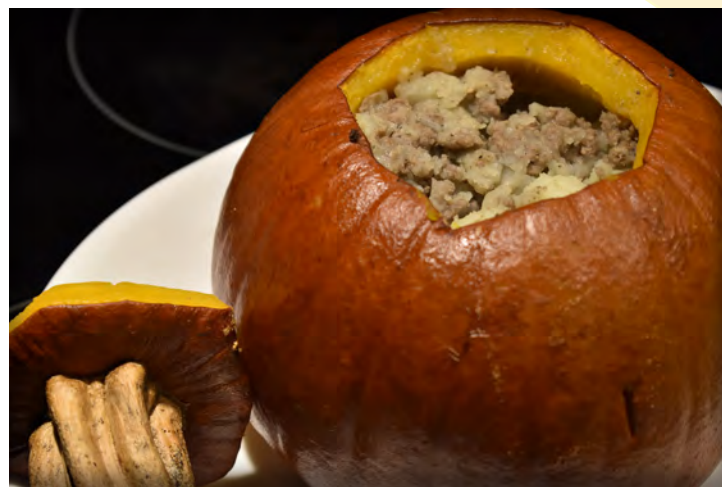
Stuffed Pumpkin Closeup