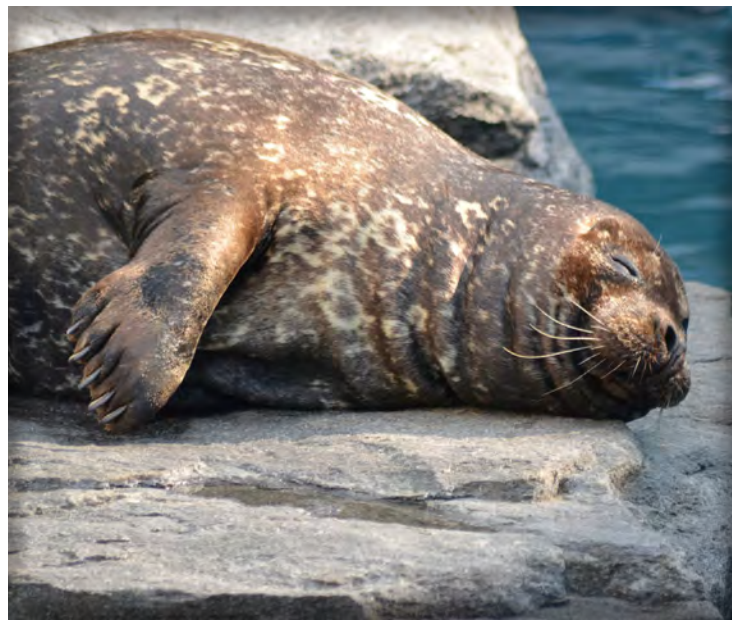
Mystic Aquarium Seal