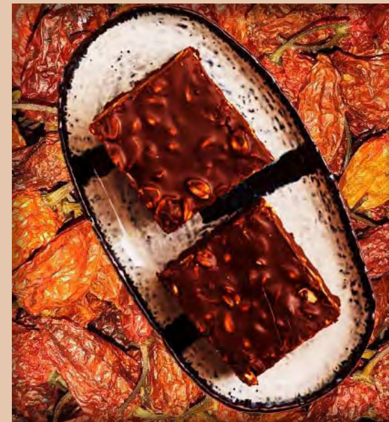
Ghost Pepper Brownies on top of of Ghost Peppers