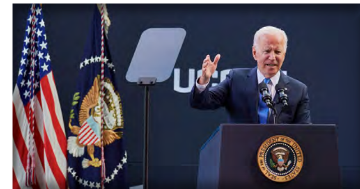
President Joe Biden

“The world is watching,” he said. “Autocrats believe that the world is evolving so swiftly that democracies cannot produce consensus quickly enough to get things done.”