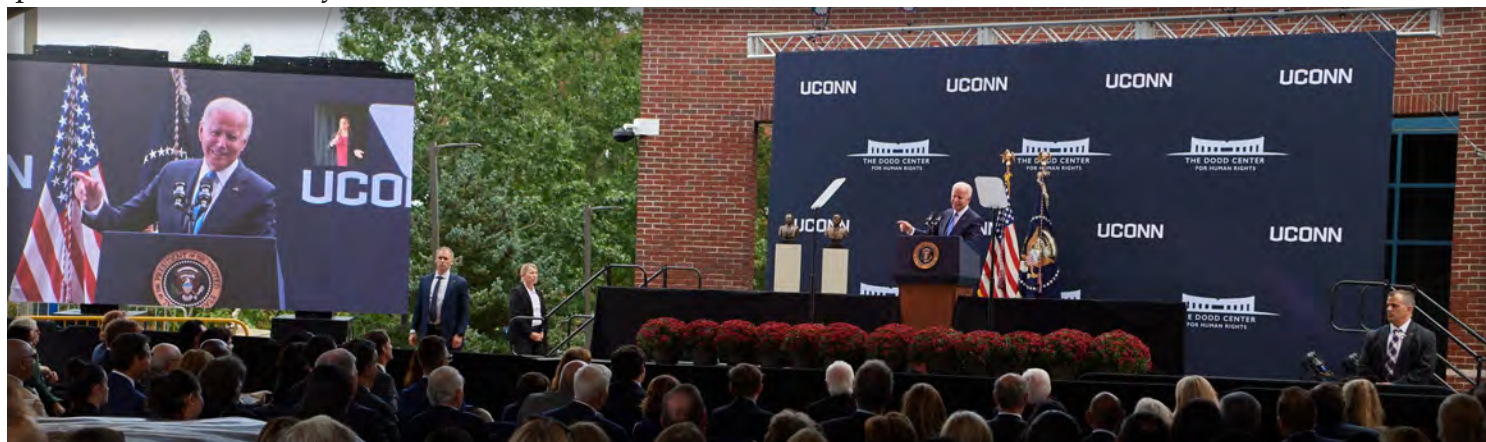
President Joe Biden speaks during the dedication ceremony of The Dodd Center for Human Rights at the University of Connecticut main campus in Storrs on Oct. 15, 2021.

Republicans argue that the ambitious idea, when paired with Biden’s efforts to address climate change driven by greenhouse gas emissions, is too costly and would increase the nation’s debt, creating inflation. In January, the news site ProPublica reported the Federal Reserve Bank of New York’s assessment that the nation’s deficit rose by $7.8 trillion under President Donald Trump.