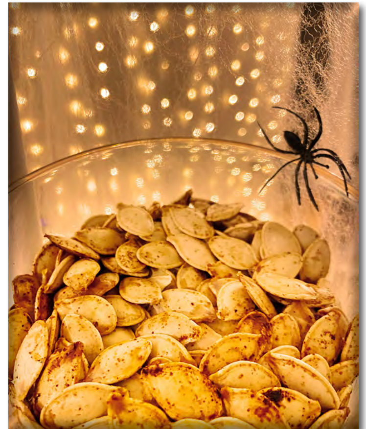
Finished Roasted Pumpkin Seeds

Roasted seeds are also good as a garnish on soup, salad, or oatmeal!