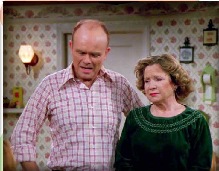
Red and Kitty Foreman

Another loveable character fans won't see return is Wilmer Valderrama, who played Fez, the foreign exchange student. In a 2016 interview with People Magazine, Valderrama says, "Fez will never happen again." Valderrama seems to have moved on completely from his character Fez, and isn't looking too interested in returning.