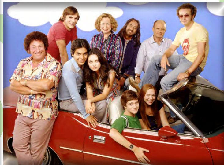
FULL Main cast Promo

While there are many details yet, and everything is subject to change, the general plot of that 90's show follows main character Leia Forman, AKA Eric and Donna's daughter, as she visits her grandparents, loveable Red and Kitty for the summer. Fans will watch as Leia discovers the life of Point Place, Wisconsin, much like her parents did when they were her age. The show could be expected to be available for streaming on Netflix in the fall of 2022, as long as there aren't any setbacks.