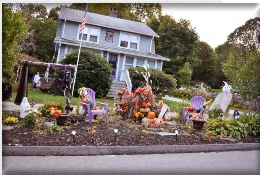
Decorated House