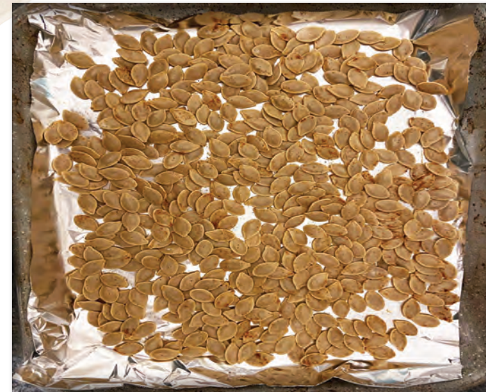
Pumpkin seeds in pan

Now curl up with a spooky halloween movie and enjoy your perfectly roasted pumpkin seeds!