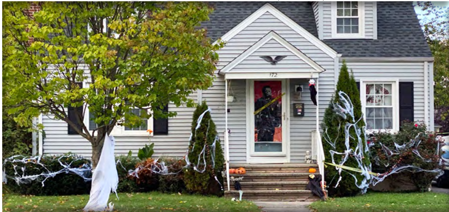
Decorated House

Do you have trouble trying to figure out how to decorate your home this Halloween for you local trick-or-treaters?