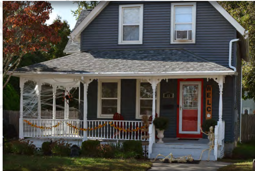
Decorated House