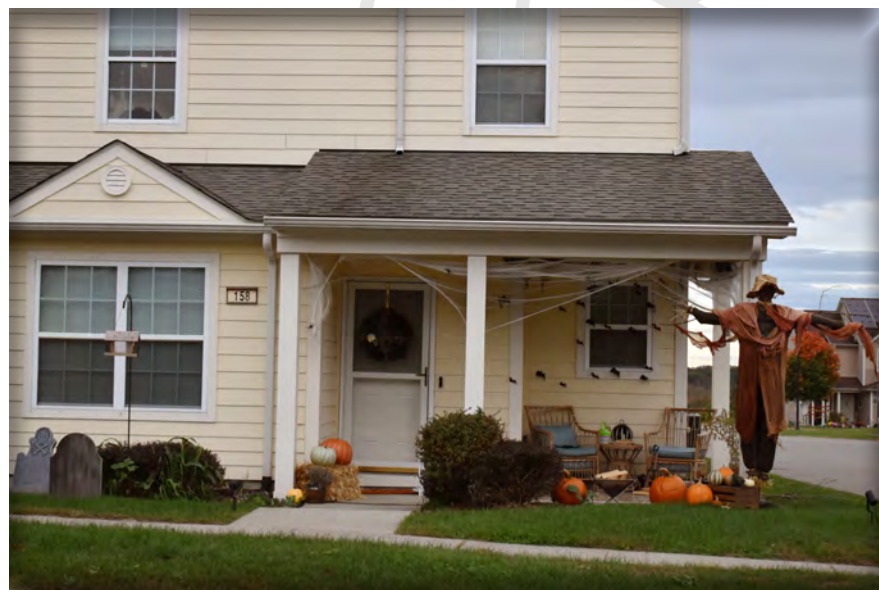
Decorated House