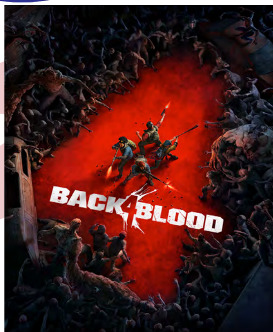
Back 4 Blood Poster

Left 4 Dead's influence and legacy were never in doubt, but there's this notion that the iconic co-op zombie shooter from Turtle Rock and Valve had a vague quality that couldn't be explained; a formula that no one has been able to duplicate.