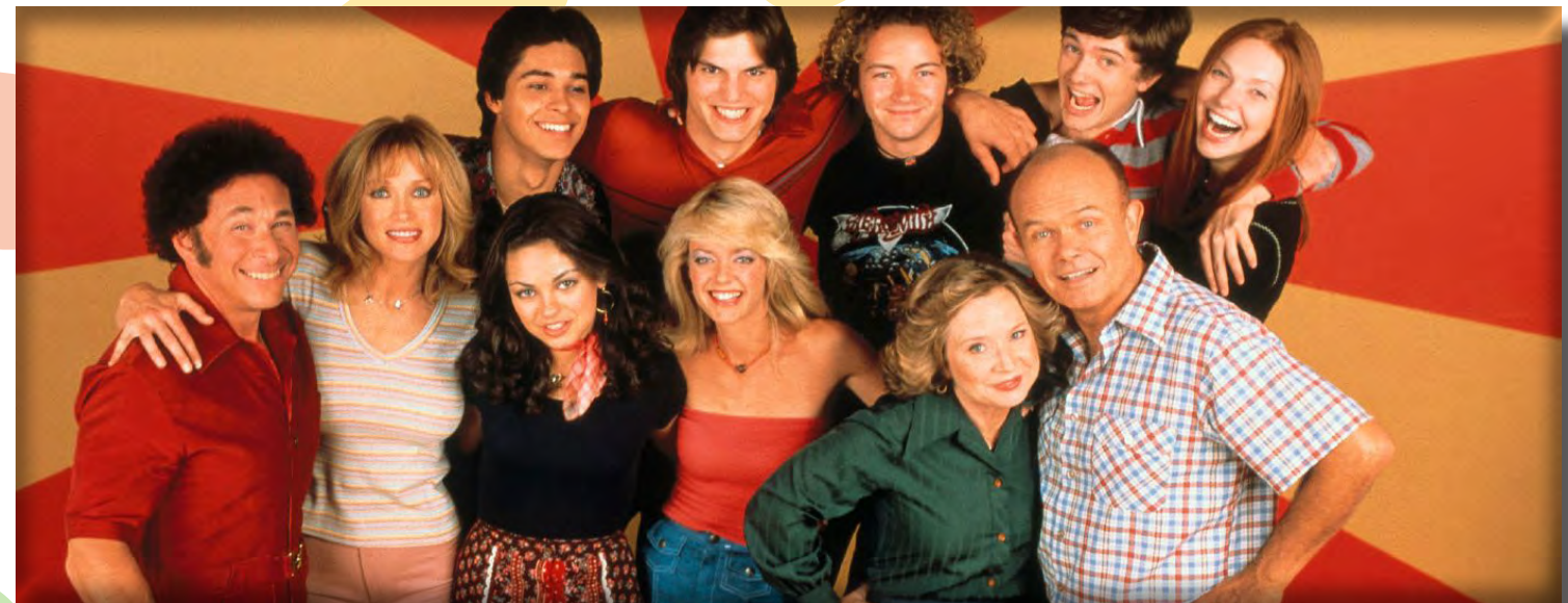
FULL Main Cast Promo Photo