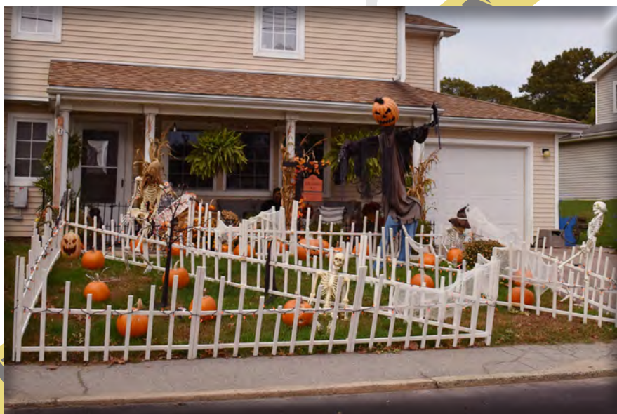
Decorated House