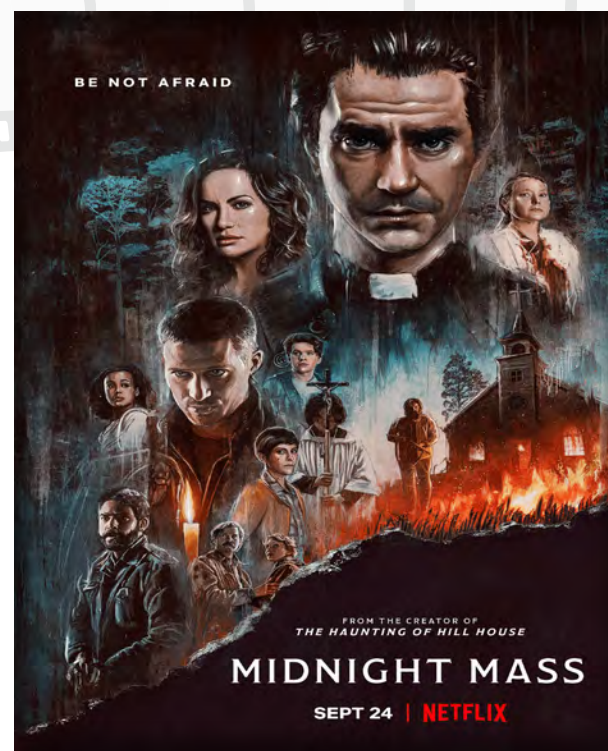
Midnight Mass Poster

Crockett Island itself is home to many different people. From those who still fervently believe, to those who have lost their faith in their church and their dying community and those who don't get involved at all. However, with the new mass services by Father Paul and miraculous miracles beginning to sprout up on the island, the whole core of Crockett Islands community begins to be shaken up.