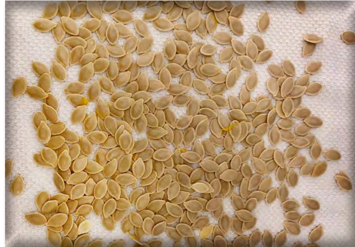
Pumpkin seeds on towel