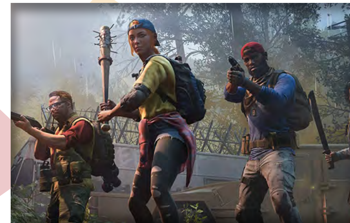
Back 4 Blood Promotional

Before you leave the safe room, you go through a buying phase in which you decide how to spend your Copper. Copper, a money gained at the end of each segment and located throughout the levels, can be spent on weapon attachments, weapons, grenades, ammo, and team-wide upgrades that improve the efficacy of your various pieces of equipment or increase the amount of them you can carry.