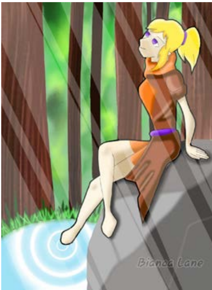
“Just Thinking” : This is a redraw of something I did back in 2017.