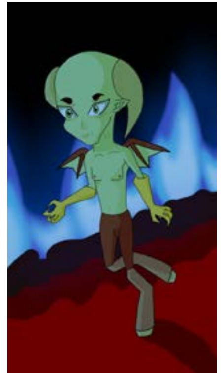
“Welcome to the Underworld” : First ever good digital drawing.