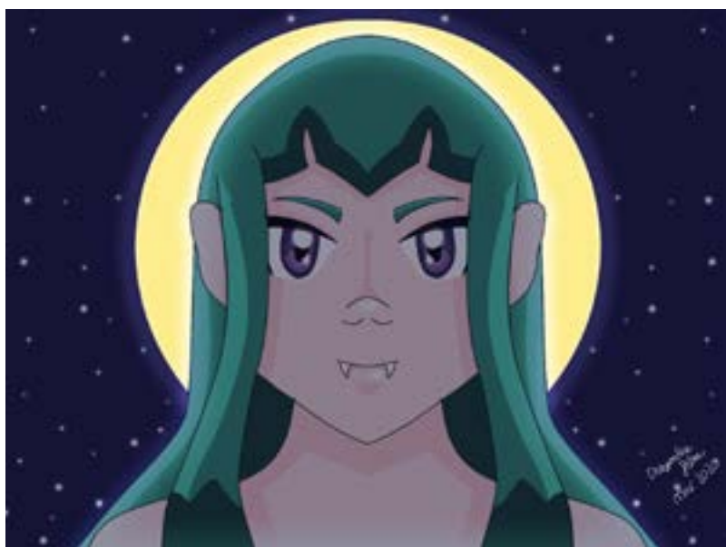
“Jade of the Night” : I like mythical creatures and I drew a vampire.