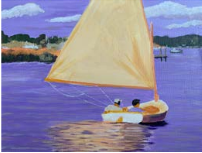
“Racing Past Mohegan Bluff”