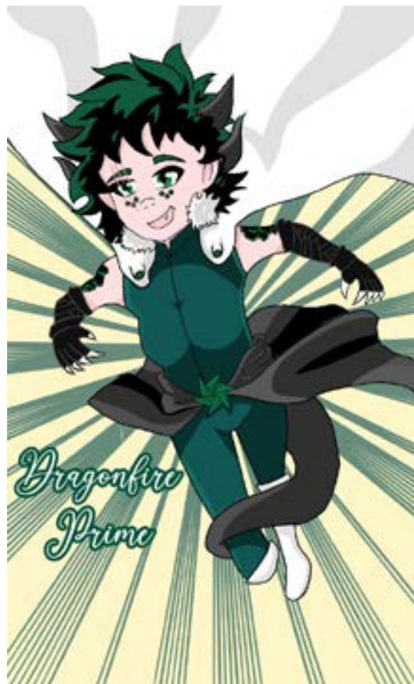
“Gojira Dragon Hybrid Deku” : A fanart I did for a Fanfiction.