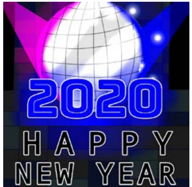
“Happy 2020...or Not” : I created this to post right as the ball dropped.