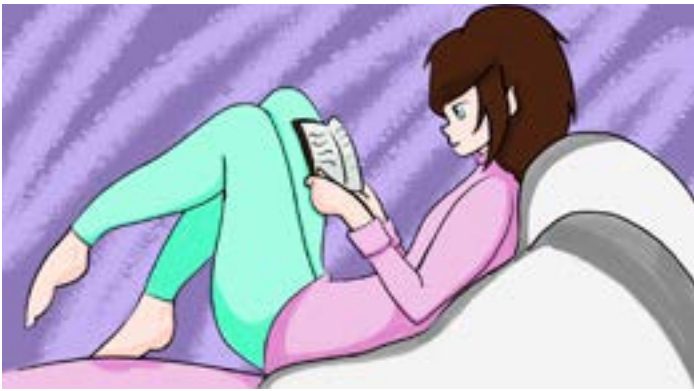
“Good Reads” : Created for The Current.