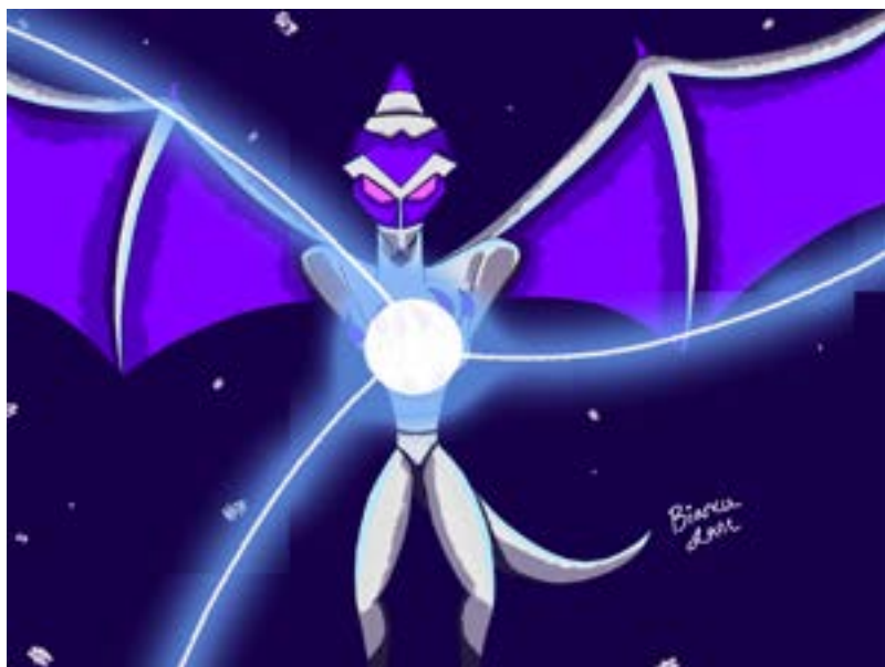
“Dragon Attack” : Inspired by Yu-Gi-Oh!’s Stardust Dragon.