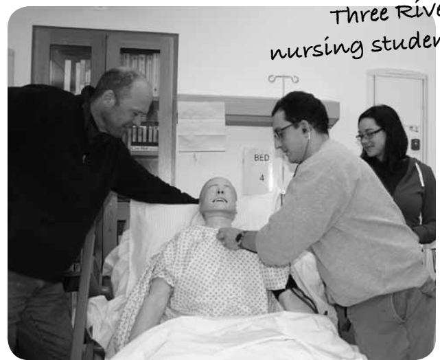
Three Rivers nursing students

Non-degree students may be required to take the Computerized Placement Test. Information about how to prepare for and sign-up for a placement testing session is sent to new non-degree students with their acceptance