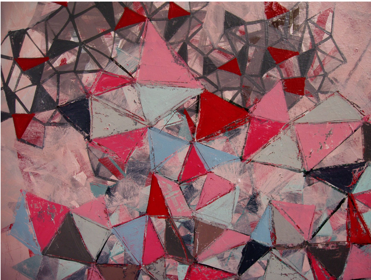
Detail of #richardsimmons, acrylic on panel, 24" x 24", 2014.